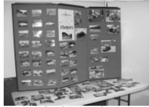
Display of CPPC Member Cars